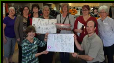
Thank You Elite Repeat