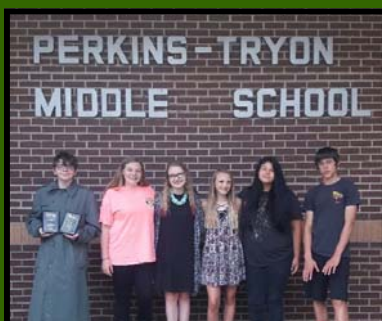
9th Annual Art Contest