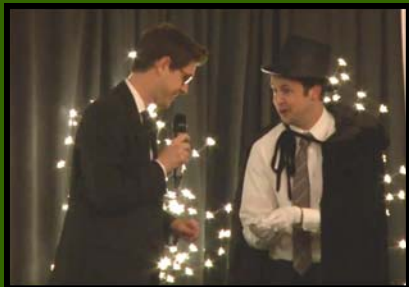
An Evening to Remember