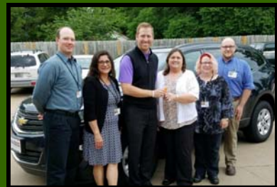
Wilson Family Auto Donation